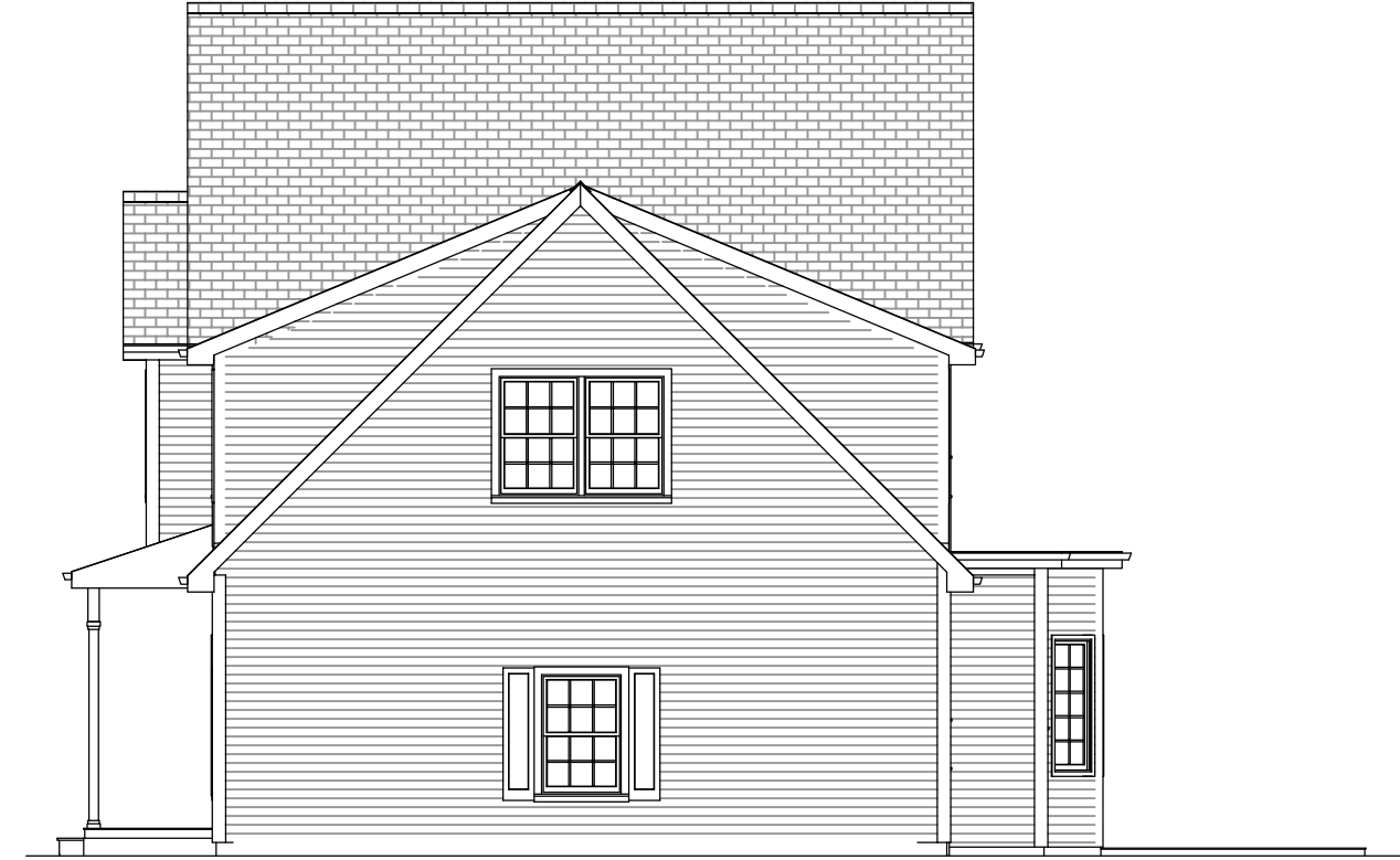
RIGHT ELEVATION SCALE: 1/8"=1'-0"