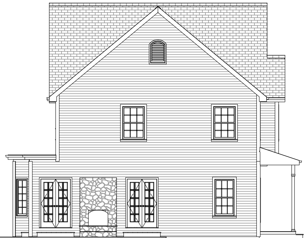
LEFT ELEVATION SCALE: 1/8"=1'-0"