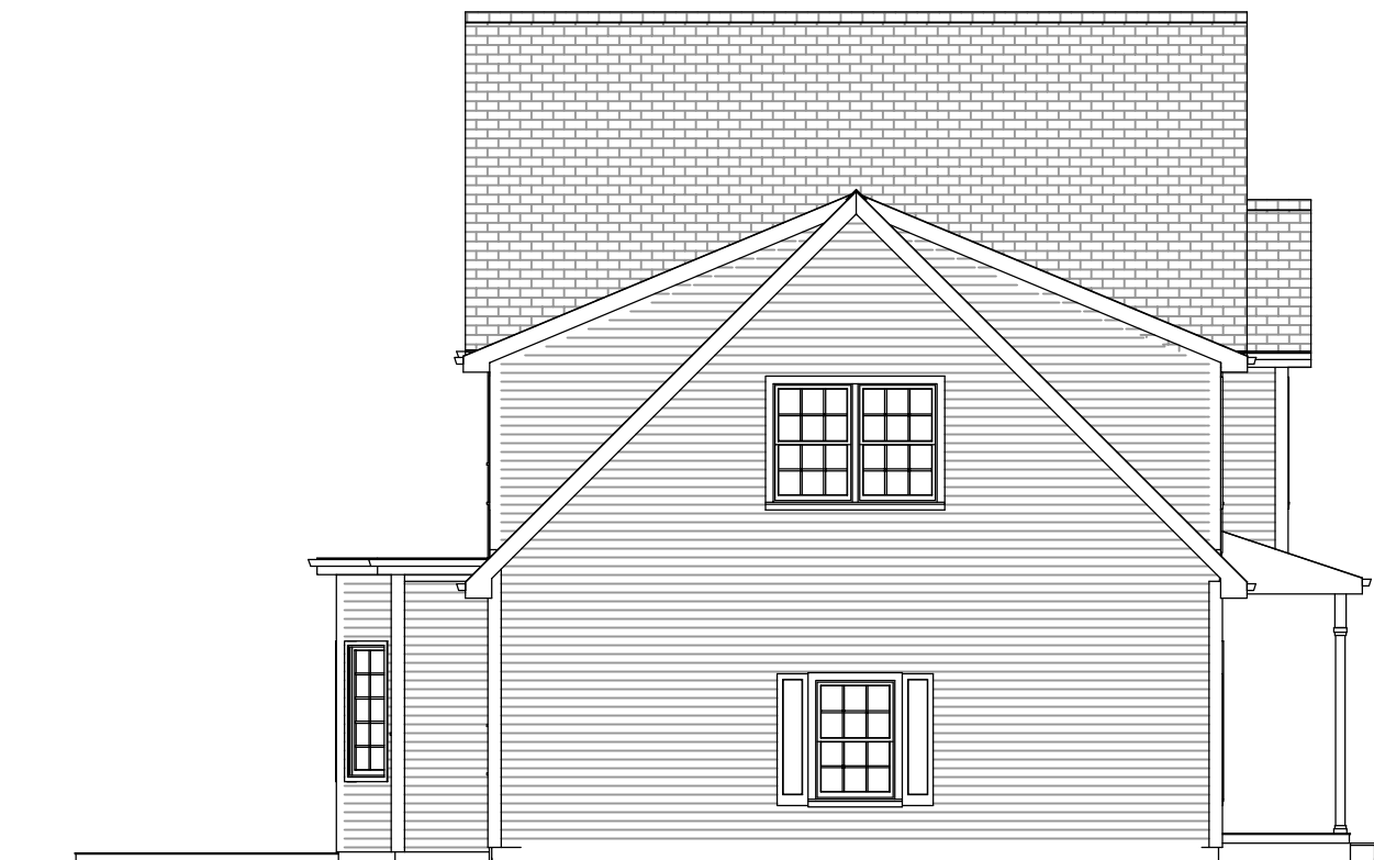
LEFT ELEVATION SCALE: 1/8"=1'-0"