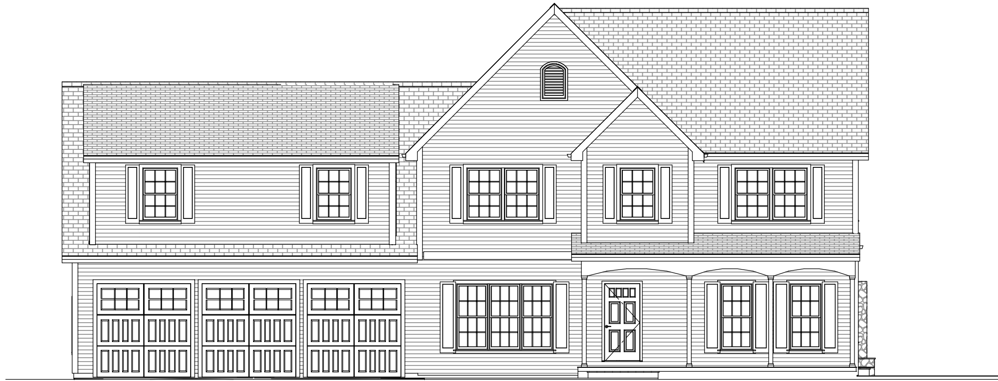
FRONT ELEVATION SCALE: 1/8"=1'-0"