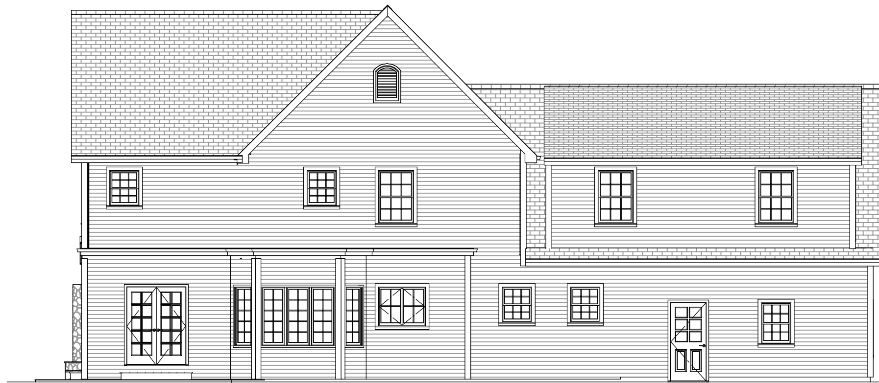
REAR ELEVATION SCALE: 1/8"=1'-0"