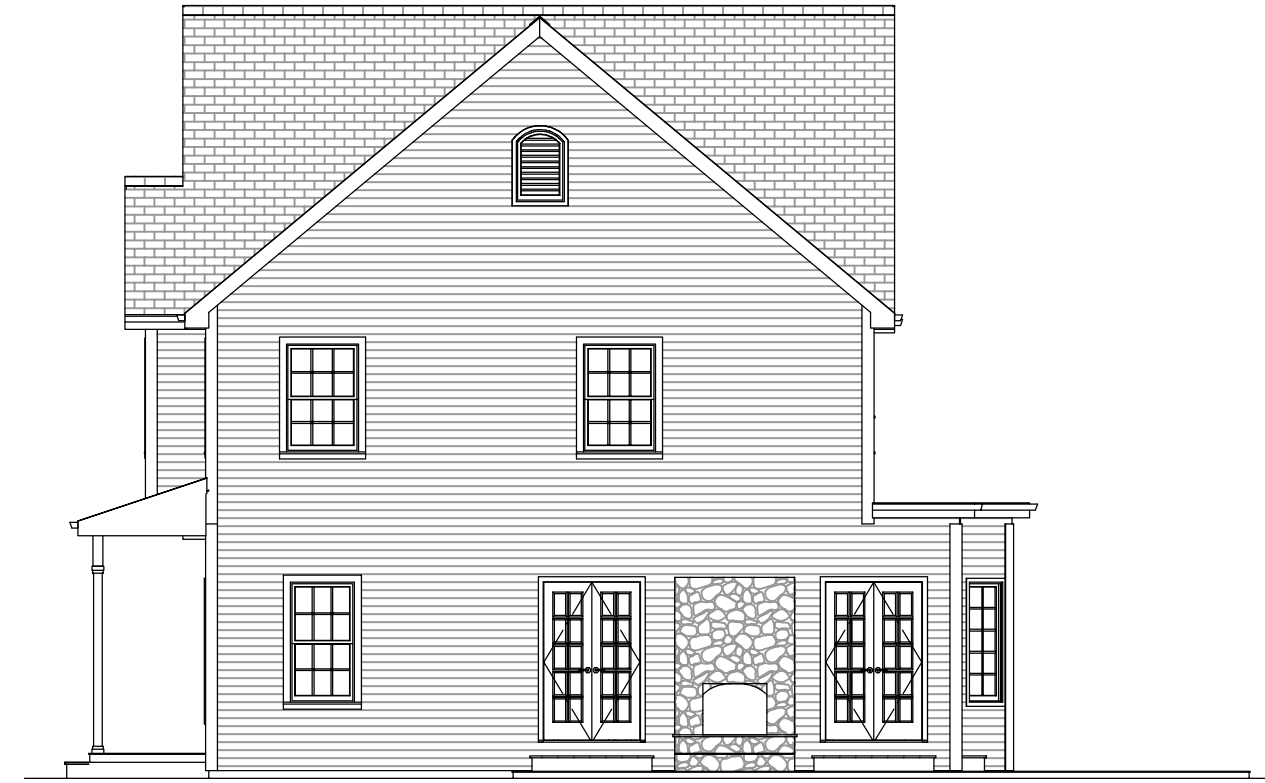
RIGHT ELEVATION SCALE: 1/8"=1'-0"